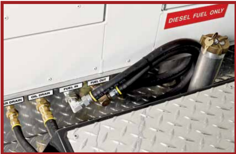
Engineered to simplify service and maintenance