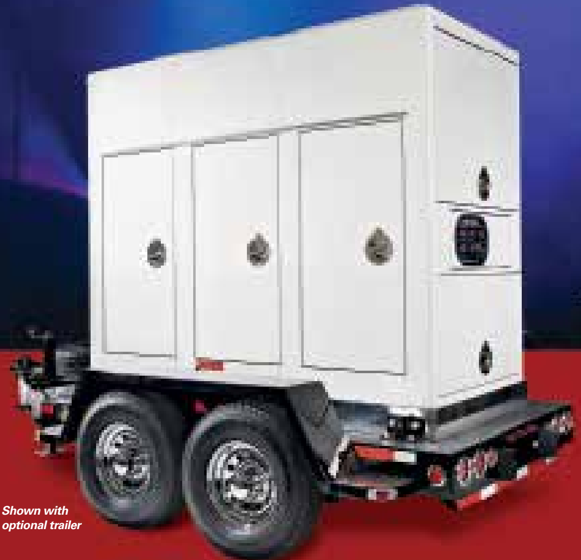
Shown with optional trailer

Trusted by the entertainment industry for more than 50 years, MQ Power Studio Generators are designed and engineered to be durable sources of power generation. Our studio line includes standard models ranging from 600 amps to 1600 amps, but we can also custom design units to fit your unique application. That's why MQ Power Studio Generators continue to set the standard for premium quality and performance in the entertainment and special events industries.