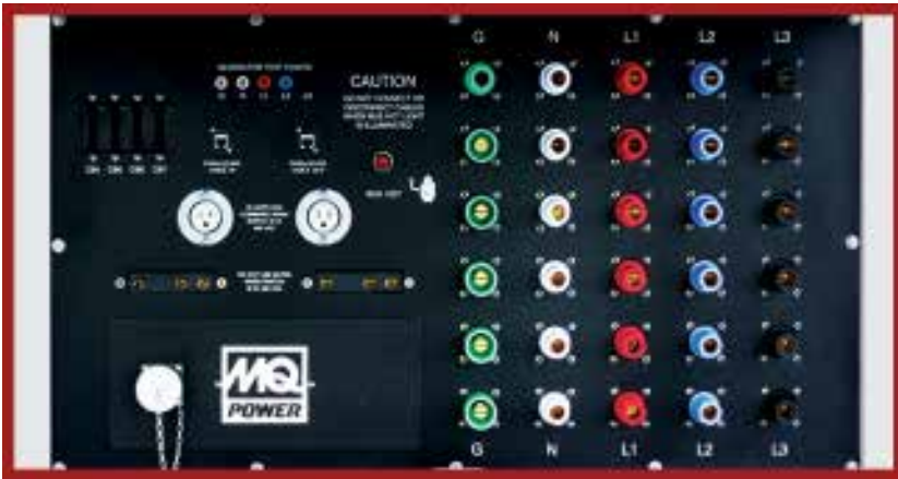
Multi-configuration connection panel