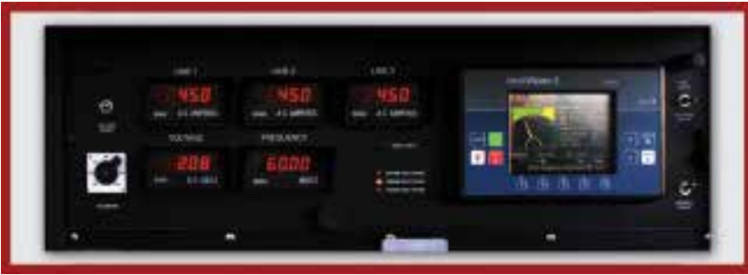
Quick-read LED instrumentation