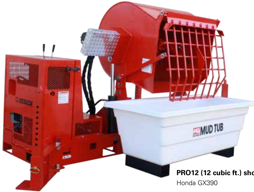
PRO12 (12 cubic ft.) shown with Mud Tub (sold separately) Honda GX390

For almost 90 years MQ Essick plaster / mortar mixers have set the standard for innovation and durability. The 12 cubic foot capacity PRO12 series increases contractor productivity in applications using on-site silo dispensing systems. The PRO12 uses a powerful hydraulic drive to power through the toughest mix designs. A unique over-center dump design easily discharges material into large mud tubs with minimal operator fatigue.