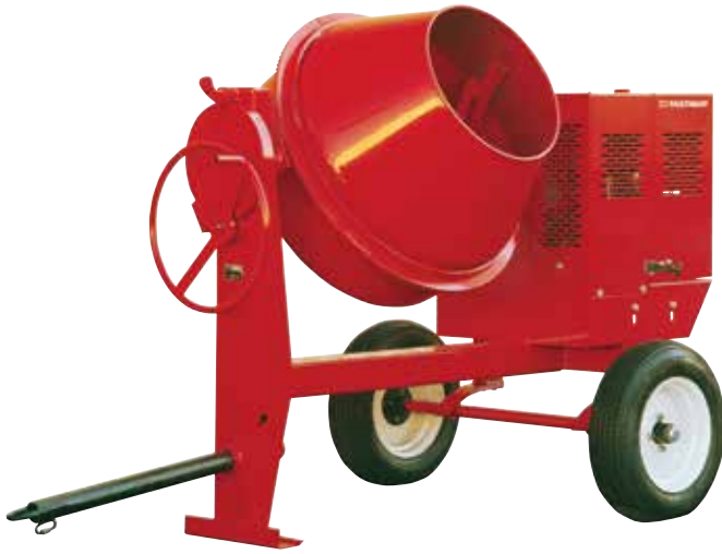
Model MC94S (9 cubic ft.)

Multiquip concrete mixers are available with either steel or polyethylene drums. Their durable construction and low maintenance requirements will provide you with years of reliable service.