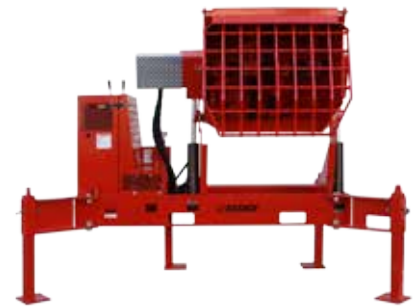
PRO12 - retractable, swing away stabilizers adapt to application requirements.