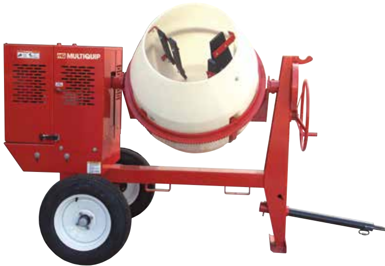
Model MC94P (9 cubic ft.)

A simple tap with a rubber mallet does the job — cleans out in minutes without dents, rust or cracks!