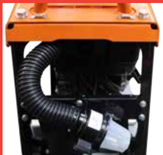
Cyclonic pre-cleaner - significantly reduces maintenance frequency and prolongs maximum efficiency of engine.