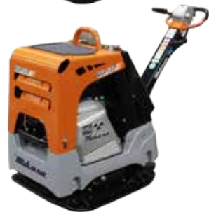
Plate size WxL in (mm) - 24x34 (600x860) Centrifugal Force lbs. (kN) - 10,116 (45) Exciter Speed VPM - 4,400 Operating Weight lbs. (kg) - 794 (360) Max travel Speed ft/min (m/min) - 79 (24) Cyclonic Pre-Cleaner - Single