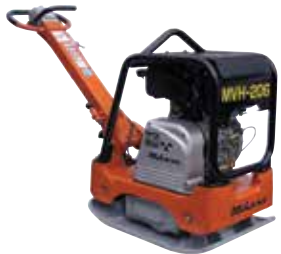
Plate size WxL in (mm) - 16.9x27.6 (430x700) Centrifugal Force lbs. (kN) - 6,070 (27) Exciter Speed VPM - 5,400 Operating Weight lbs. (kg) - 331 (150)