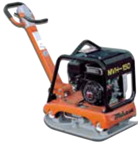
Plate size WxL in (mm) - 15.8x23 (400x580) Centrifugal Force lbs. (kN) - 5,058 (22.5) Exciter Speed VPM - 6,000 Operating Weight lbs. (kg) - 256 (116)