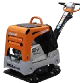
Plate size WxL in. (mm) - 20x27.6 (510x700) Centrifugal Force lbs. (kN) - 7,868 (35) Exciter Speed VPM - 5,200 Operating Weight lbs. (kg) - 459 (208)