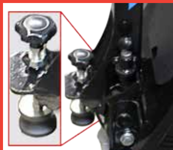
Adjustable handle height - reduce operator fatigue and improves comfort .