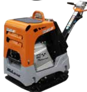
Plate size WxL in (mm) - 24x34 (600x860) Centrifugal Force lbs. (kN) - 10,116 (45) Exciter Speed VPM - 4,400 Operating Weight lbs. (kg) - 794 (360) Max travel Speed ft/min (m/min) - 79 (24) Cyclonic Pre-Cleaner - Single