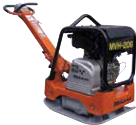
Plate size WxL in (mm) - 16.9x27.6 (430x700) Centrifugal Force lbs. (kN) - 6,070 (27) Exciter Speed VPM - 5,400 Operating Weight lbs. (kg) - 331 (150)