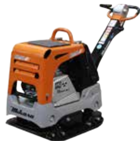
Plate size WxL in. (mm) - 20x27.6 (510x700) Centrifugal Force lbs. (kN) - 7,868 (35) Exciter Speed VPM - 5,200 Operating Weight lbs. (kg) - 459 (208)