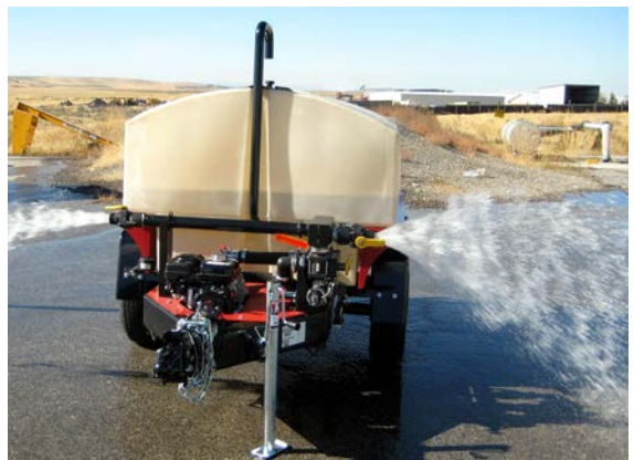
Full left/right 2" discharge demonstrated.