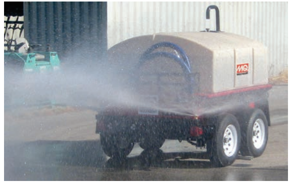
Rear spray bar produces a 30' cone pattern using water pump pressure or a 9' cone under gravity pressure.