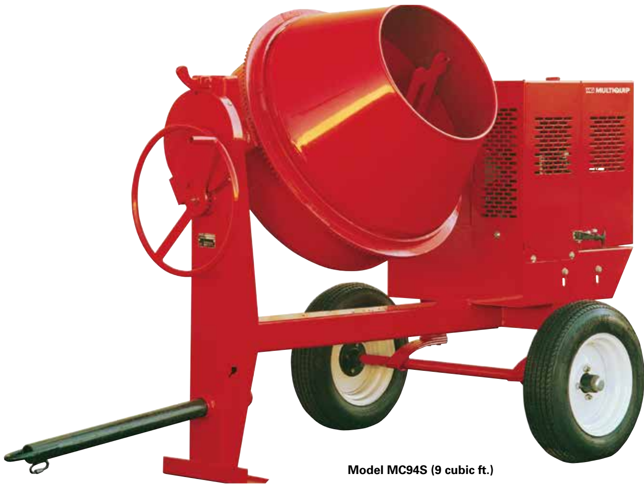
Model MC94S (9 cubic ft.)

Multiquip concrete mixers are available with either steel or polyethylene drums. Their durable construction and low maintenance requirements will provide you with years of reliable service.