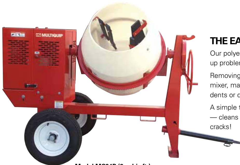
Model MC94P (9 cubic ft.)

The MC12PH concrete mixer handles your biggest and toughest applications. It features a 12 cubic ft. Easyclean™ drum and powerful Honda GX340 engine.