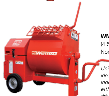
WM45 (4.5 cubic ft., Steel drum) Non-towable

Unique wheelbarrow design ideal for small batch jobs and indoor work. Available with either electric or gasoline drive.