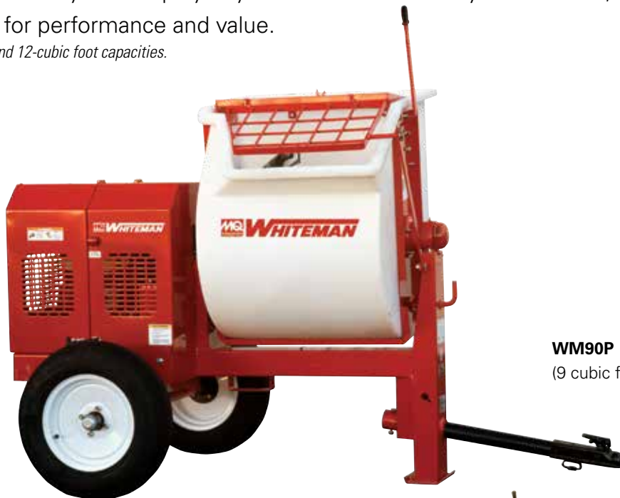
WM90P (9 cubic ft., Poly drum)

Models available in 7-, 9-, and 12-cubic foot capacities.