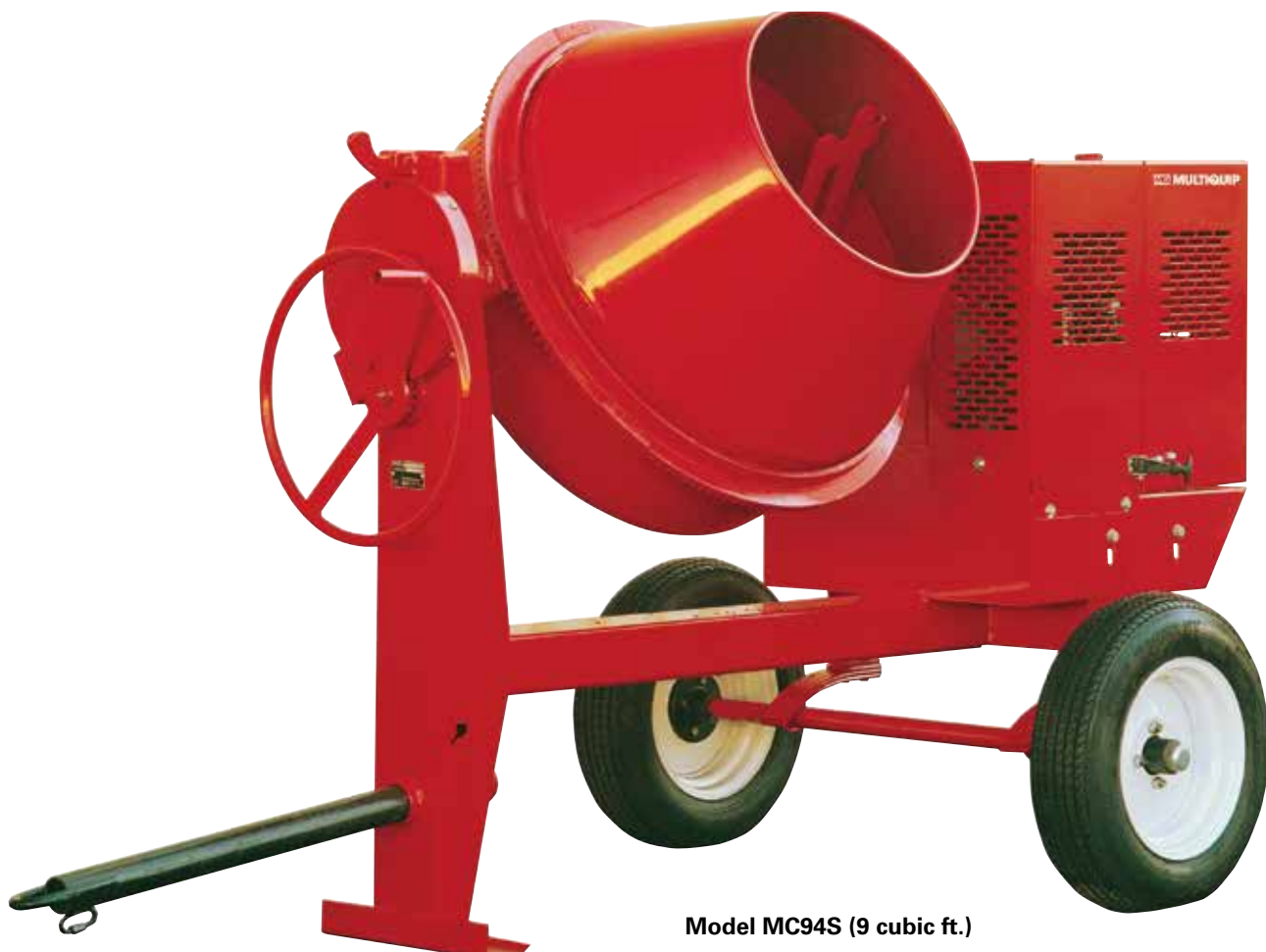
Model MC94S (9 cubic ft.)

Multiquip concrete mixers are available with either steel or polyethylene drums. Their durable construction and low maintenance requirements will provide you with years of reliable service.