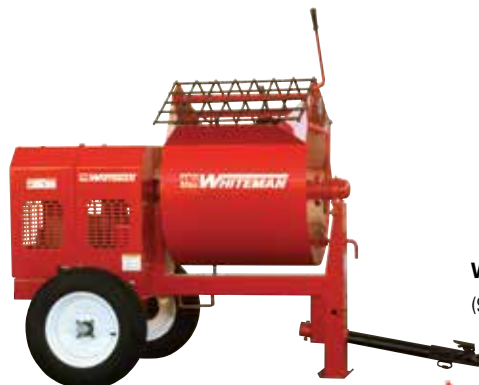
WM90S (9 cubic ft., Steel drum)