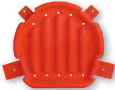
Standard Base (requires sand bag)

We have the solution. Traffix Devices offers the largest selection of channelizer drum bases in the industry. Choose from an array of different types and styles that best fit your needs and budget. And remember, whichever base you select, it will fit any Traffix channelizer drum top, even the ones you may have purchased years ago.