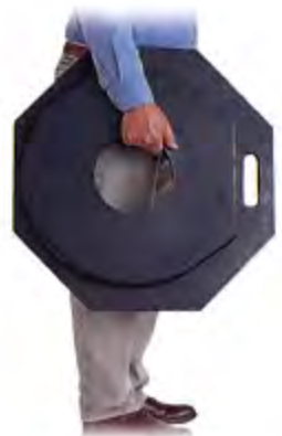
Worker using center carrying hole with 40-lb. base

TraFFix 100% recycled rubber base is the "sandless" way to ballast channelizer drums. The rubber base "grips the road" and minimizes drum movement due to wind gusts. Rubber bases come in 40 and 25 pound weights with two convenient carrying methods.