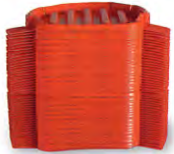
25 standard bases nest for shipment and storage

Economical and easy to use - simply place the base on the ground, add a sand bag and snap - lock the drum top to the base. Made of durable, impact resistant polyethylene.