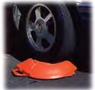
Automobile running over a San-Fil base

San-Fil bases are designed to hold approximately 50 pounds of sand. The twist lock cover keeps the sand inside the base. Two carrying handles make movement and placement an easy job. The low profile 4" high base easily clears vehicle undercarriages and can even support the weight of any vehicle.