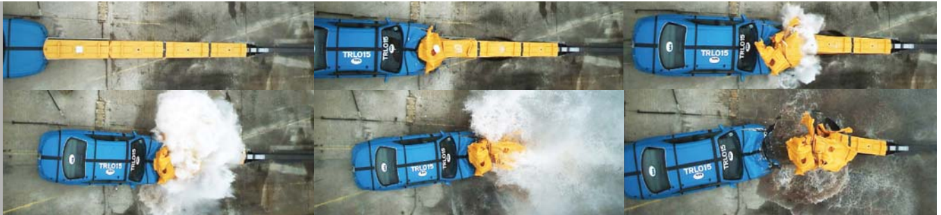
Tested and Passed: EN1317-4 P4 Impact Speed: 110 Km/h Vehicle Type: 1500 kg Bullet Vehicle Impact Angle: Head-On Centre