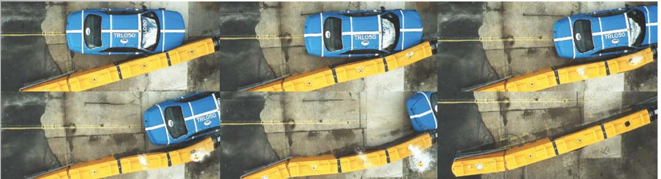
Tested and Passed: EN1317-4 P4 Impact Speed: 110 Km/h Vehicle Type: 1500 kg Bullet Vehicle Impact Angle: 15° Side