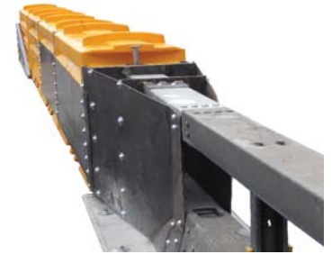
Saving Lives with the SLED EURO-TERMINAL