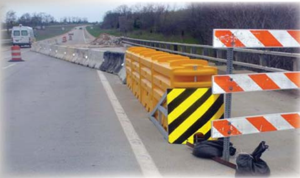
SLED™ TL-3 in use on a Missouri Highway