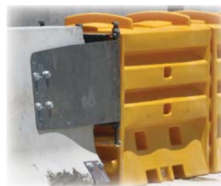
Concrete Barrier Attachment