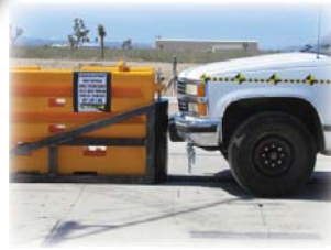
Inline TL-3 Truck Test Pre Impact