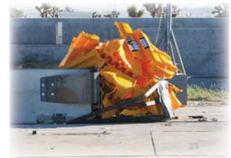
Inline TL-3 Truck Test Post Impact