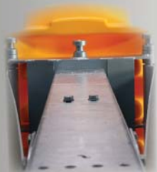
Steel Barrier Attachment