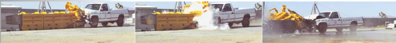
SLED™ TL-3 4500 lb. Pick-Up Truck Impact Attached to Concrete Median Barrier Wall

Each SLED module is manufactured from a high visibility yellow polyethylene that is UV stabilized to minimize degradation. It is designed to deform and rupture on impact, absorbing the energy of the errant vehicle. SLED has the most versatile transition for shielding all permanent and temporary portable barriers. The combination of hinging and contouring, allows the transition panels of the SLED End Treatment to be attached to narrow, wide or other profile shapes with either converging, or diverging angles, up to 10 degrees.