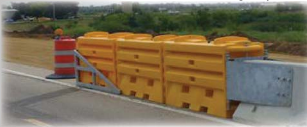
SLED™ TL-2 in Illinois