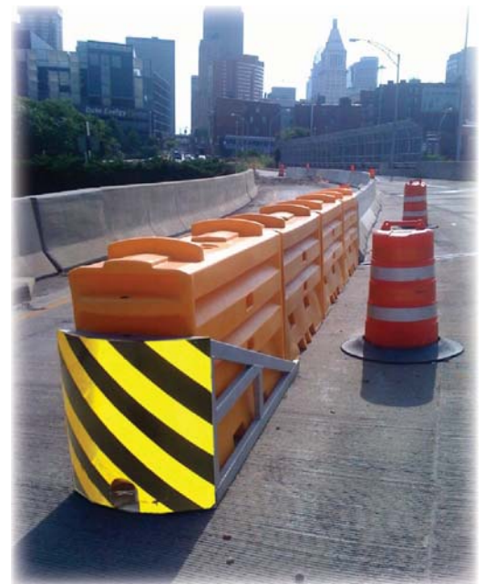
SLED™ TL-3 in Downtown Cincinnati, Ohio