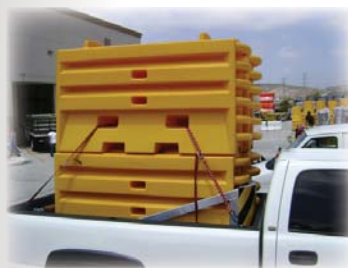
SLED™ TL-3 Transports in a Pick-Up Truck