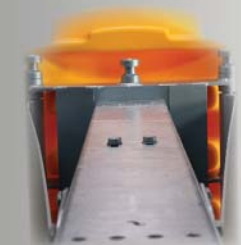
Steel Barrier Attachment