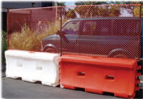
Water-Wall with extended connection pins and plastic fence.