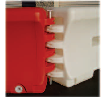
Water-Wall can pivot 30-degrees and be locked together with steel connection pins.