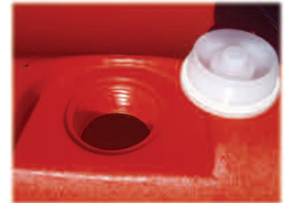
New tamper resistant, corner offset drain plug with coarse buttress thread — screws in or out in only 2 1/2 turns.