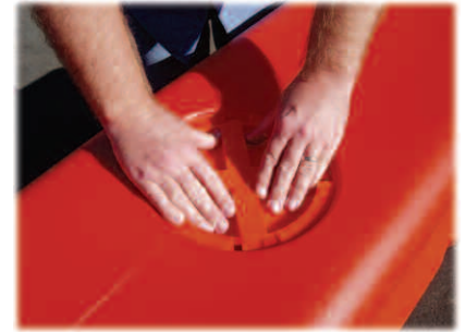
Large 8" fill hole speeds filling process, includes twist-lock plastic cap.