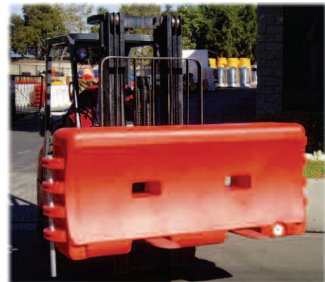
Water-Wall can be easily lifted and placed using a forklift or pallet jack.