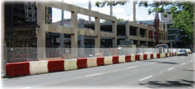
The TrafFix Water-Wall used as a Longitudinal Barricade along a job site.