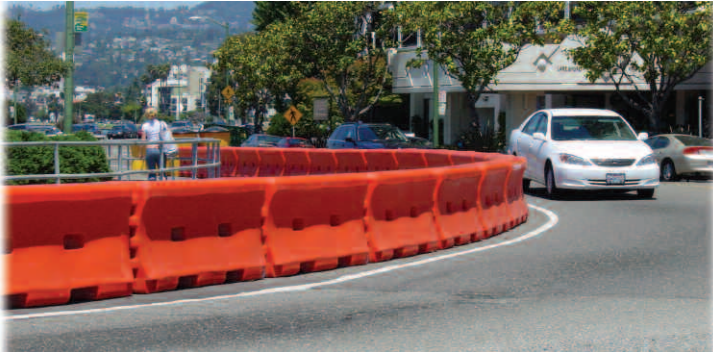
30-degree pivoting hinge design allows the TrafFix Water-Wall to handle curved roads.