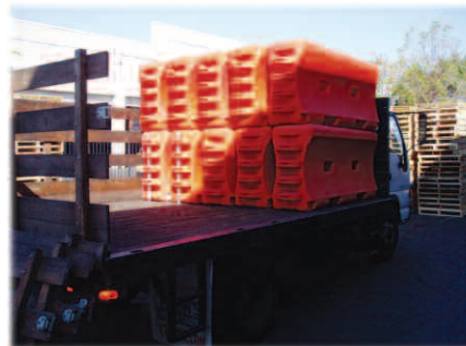
Water-Wall stacks for storage and transportation.