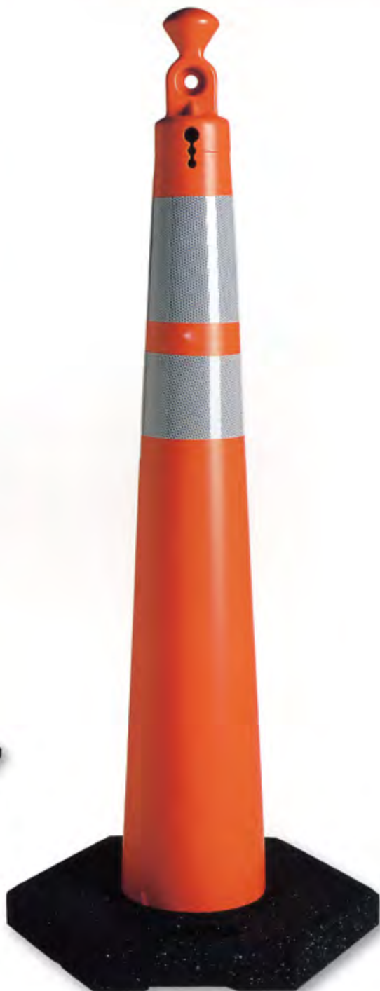
42" Grabber-Cone with (1) 6" and (1) 4" band of white reflective sheeting and recycled rubber base