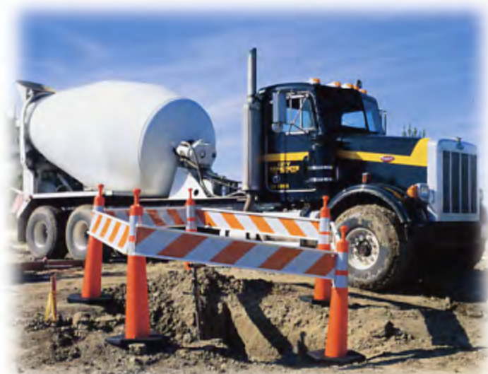
42" Grabber-Cone and plastic rails can totally enclose bores and construction work areas