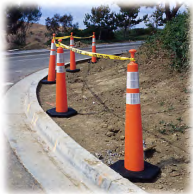
42" Grabber-Cone with caution tape wrapped around handle