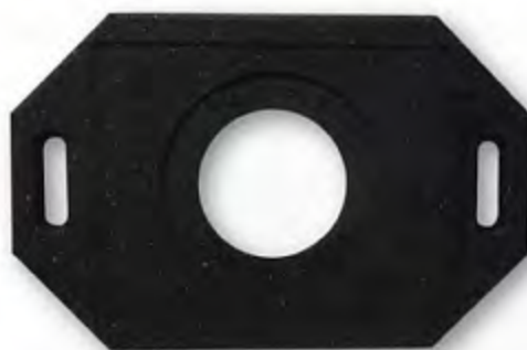
30 lb. base

The composite construction offers strength and durability. Both bases are made from 100% recycled rubber. (Weight 10, 16 or 30 lbs.)