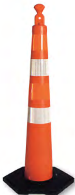
42" Grabber-Cone with (2) 4" orange and (2) 4" white bands of 3M™ diamond grade reflective sheeting