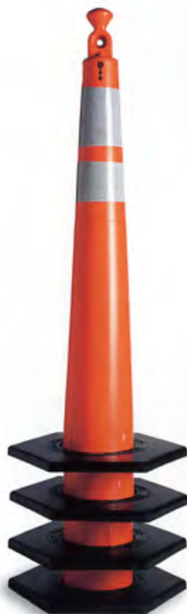
Cones stacked with rubber bases