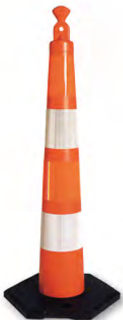
42" Grabber-Cone with (2) 6" orange and (2) 6" white bands of 3M™ diamond grade reflective sheeting