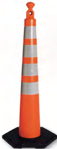
42" Grabber-Cone with (4) 4" bands of white reflective sheeting