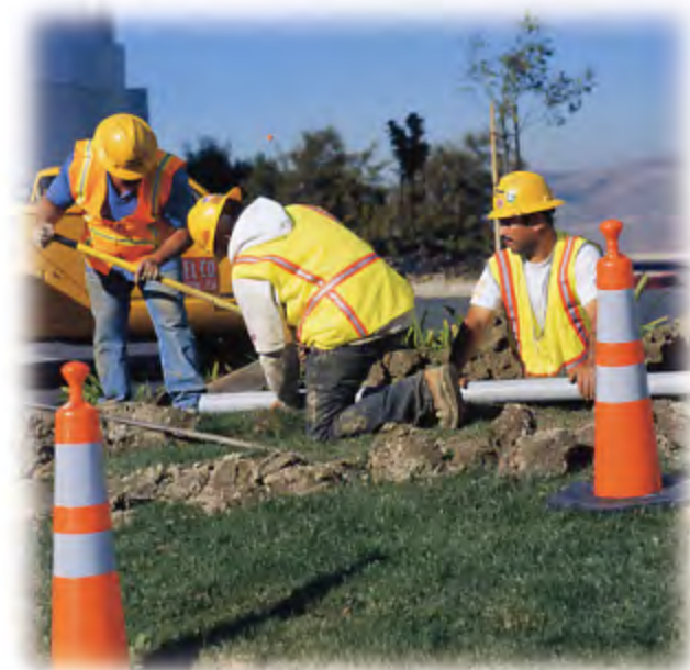
28" Grabber-Cones and Traffic vests provide high visibility to help protect workers